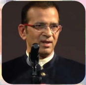
H.E. Ajay Bisaria